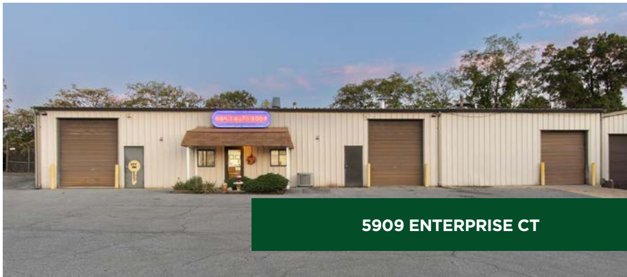
5909 ENTERPRISE CT