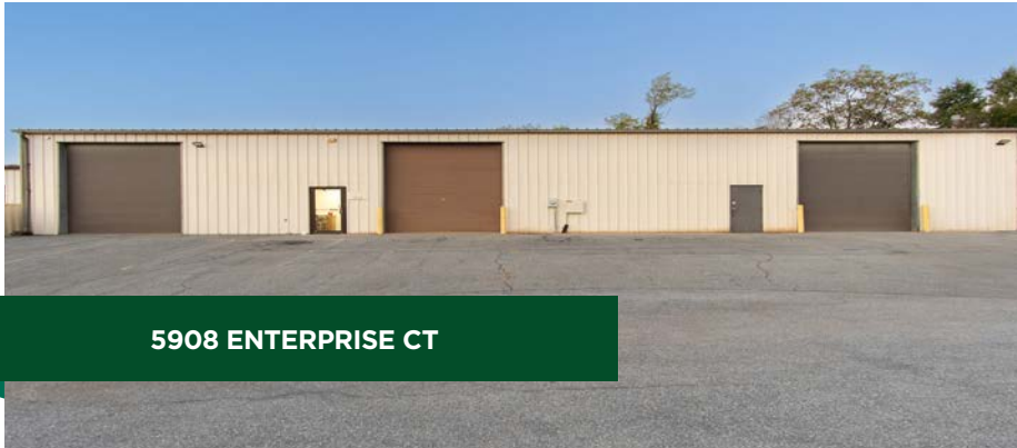
5908 ENTERPRISE CT

5908 & 5909 Enterprise Ct, Frederick, MD 21703